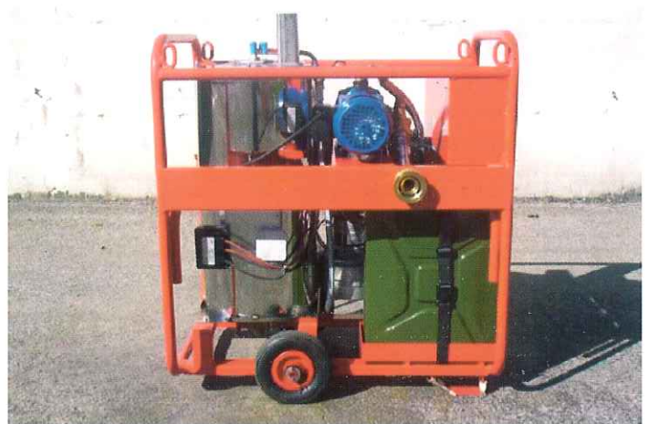
Hot water generator (70.000 KCAL/h)