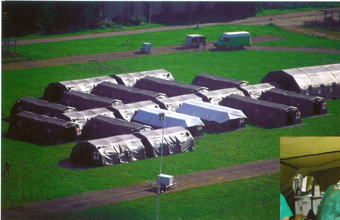
Italian Red Cross field hospital used in various missions (Sri Lanka, Pakistan)